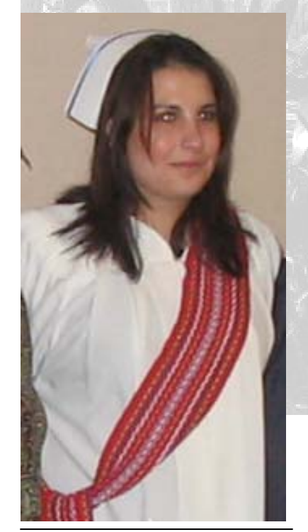
Above, former DTI Practical Nursing students